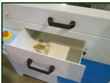
Drawer for collecting products